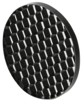
Honeycomb Size: \varnothing 33x3