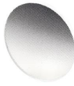
Woven Glass Size: \varnothing 33x3