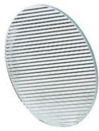
Combed Glass Size: \varnothing 33x3